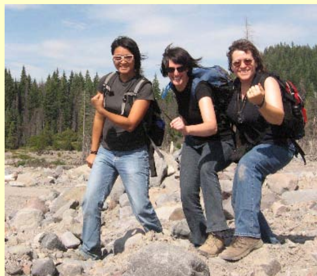
Out, Standing in the Debris Field