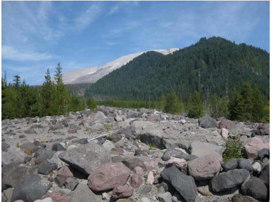
Photo: On the trail crossing the Butte Camp Dome debris flow depositional area and looking back at Mt. St. Helens.

--Bonus option: approximate 2-mile in and out stroll through the Goat Marsh Research Natural Area to view the dacite dome of Goat Mountain and Goat Marsh Lake.